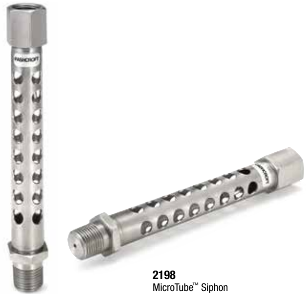
2198 MicroTube™ Siphon

Max Allowable Working Pressure: 5,000 psi at 800°F (427°C)