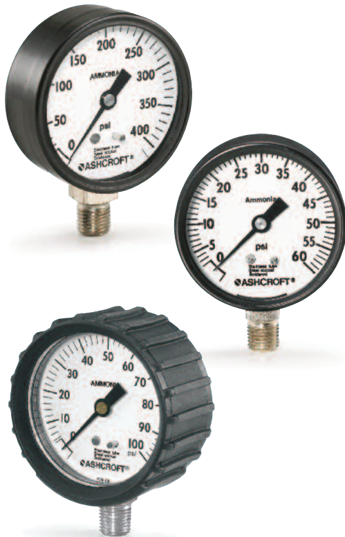
Shown with Optional Rubber Boot